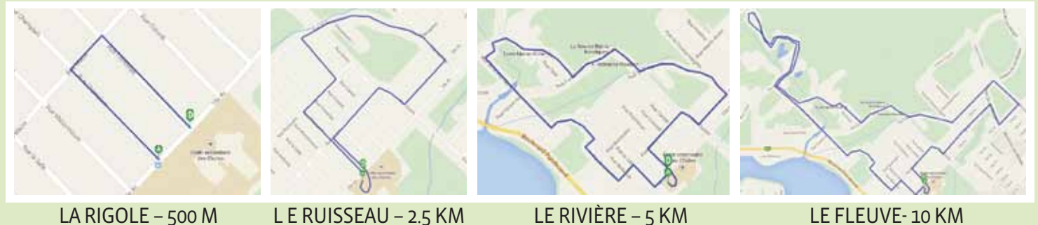
LA RIGOLE – 500 M

In collaboration with the Municipality of Rawdon, the 2 nd edition of the Course des Cascades will take place on Sunday October 4 th . The objective of this race is to raise funds for the des Cascades School, to finance activities and supplies. To register, visit https://www.inscriptionenligne.ca/Course des cascades . The organizers are looking for volunteers, interested parties can sign up on the municipality's website homepage.