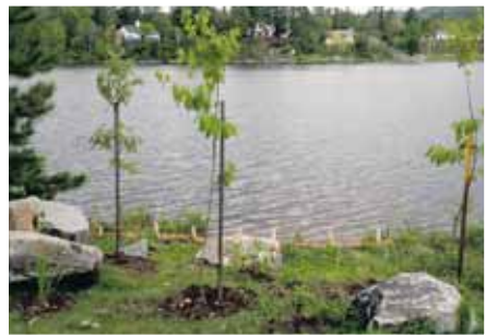
Renaturalization of the shoreline on Promenade-du-Lac Street.

Two projects to renaturalize river banks have been completed by the Rawdon Municipality in May. The first project was completed at Lake Pontbriand, on a portion of the bank located on Promenade-du-Lac Street.