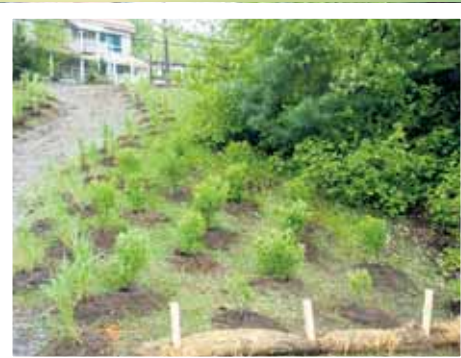
The second project was completed at Rawdon Lake, on the shore located next to the dam (on 3 rd Avenue).

These shores will serve as models for shoreline residents who must re-establish the natural character of artificial shores.